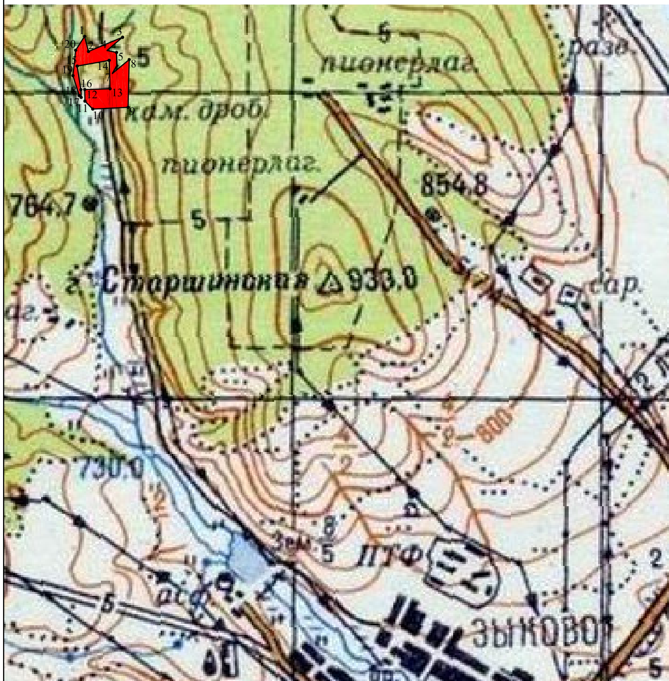
Географические координаты (Пулково 42)